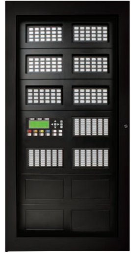
FX-4009-12N and DSPL-420DS (sold separately) Display, Backbox and Door are sold separately