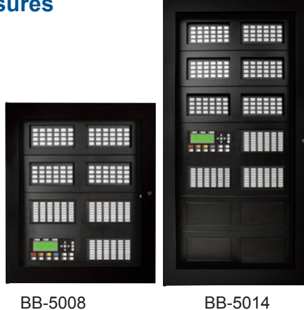
(Displays sold separately)