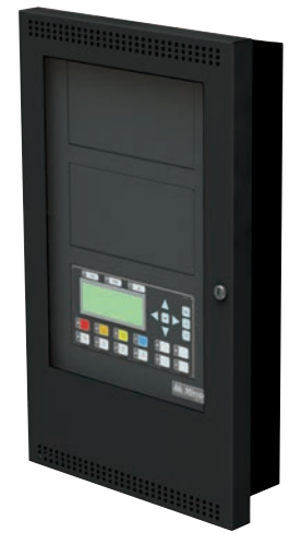
FX-4003-12N and DSPL-420DS (sold separately) Display, Backbox and Door are sold separately